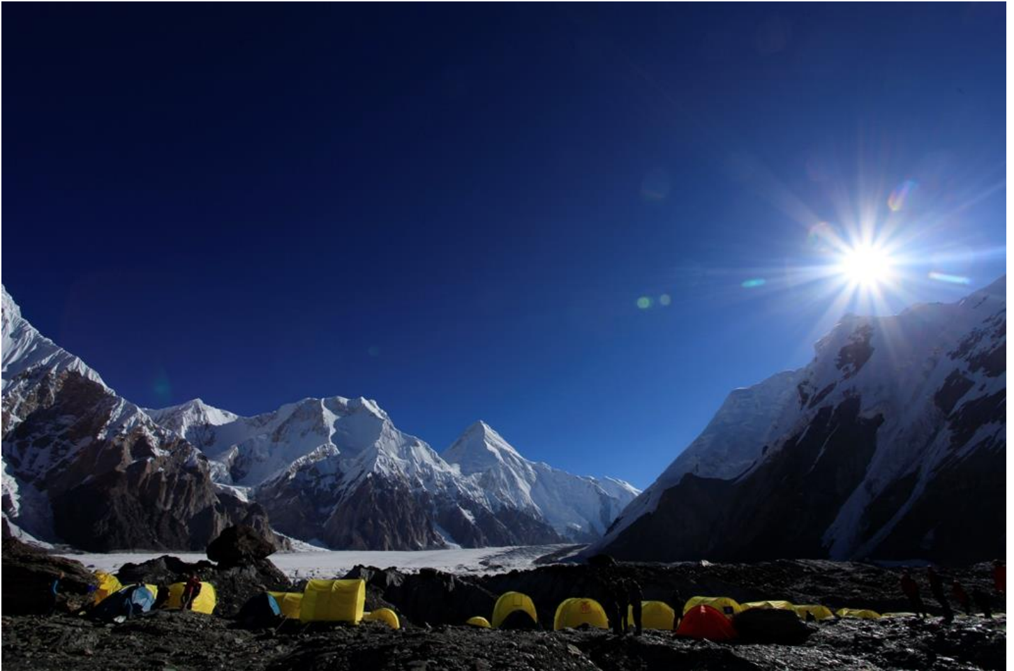
MT. Khan-Tengri EXPEDITION - 2024 [7010 M.]